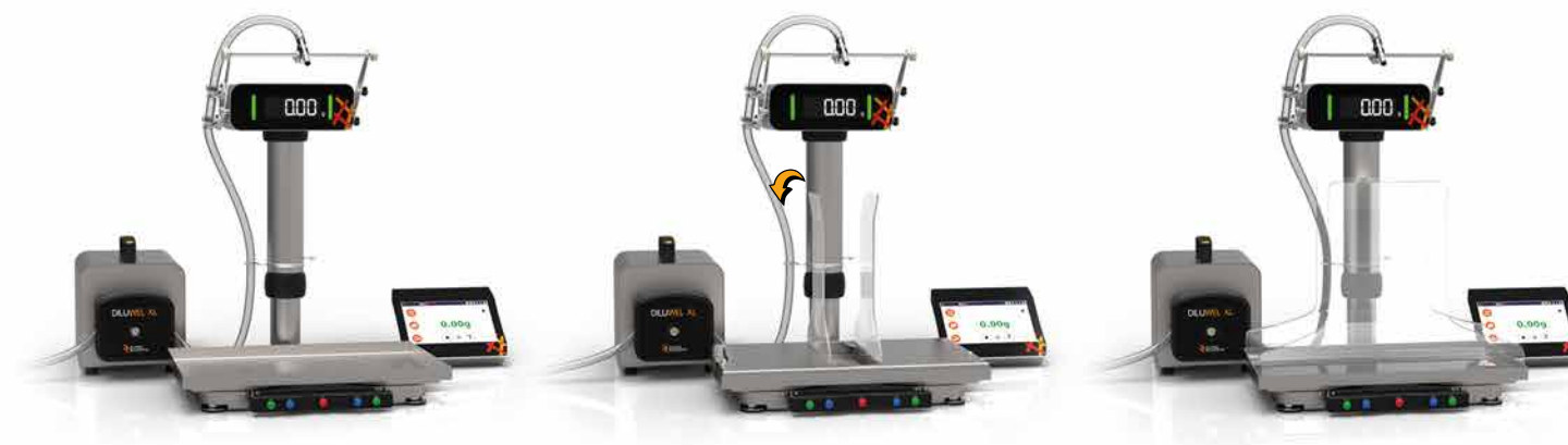
Multi-Container Bottles / Bowls / Flasks