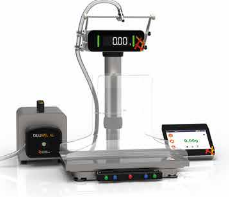
Classic 4000 ml bags